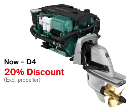
Now – D4 20% Discount (Excl. propeller)