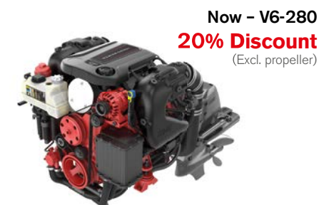
Now – V6-280 20% Discount (Excl. propeller)