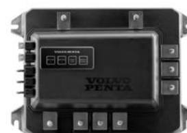
Battery Control Module.

The battery management system makes your electrical system more reliable and easier to monitor.