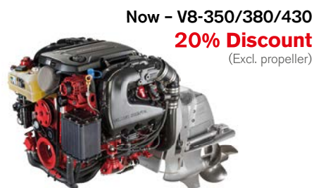
Now – V8-350/380/430 20% Discount (Excl. propeller)