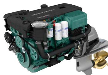
Now – D6 20% Discount (Excl. propeller)